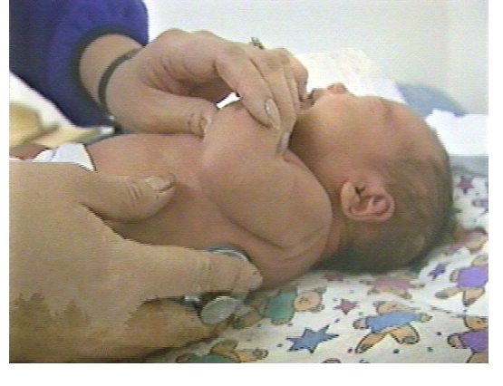
Prenatal, Newborn, and Well-Child Care