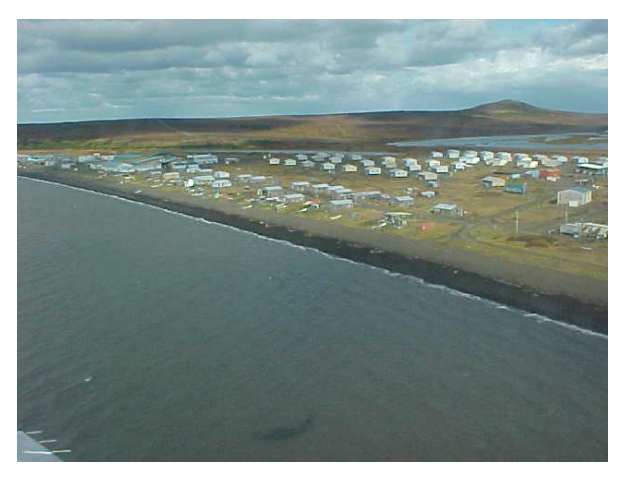
Village of Stebbins in Norton Sound 6 CHA/Ps Serve a Population of 547

Alaska has a total landmass of 586,585 square miles and constitutes one-fifth of the area of the United States (see Figure 1). Within this vast area, approximately 50,000 Alaska Natives live in over 178 villages located as far as 1300 miles from the nearest regional center (2). Ninety percent of the villages in rural Alaska are isolated from each other, separated by tremendous distances, vast mountain ranges, stretches of tundra, glaciers, and impassable river systems. Most of the communities are not connected to a road system. Air transportation is the primary means of travel on a statewide basis. Provision of goods and services and the delivery of health care to these remote sites is always a challenge.