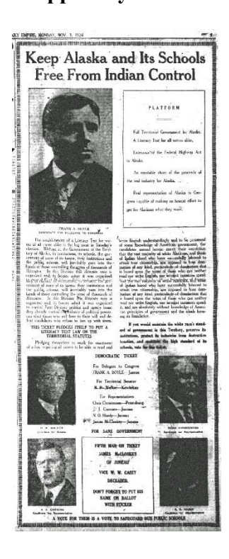
Figure 1. Advertisement with a racial appeal by non-Native candidates for the legislature.

Non-Natives feared the political power that Alaska Native voters could wield if they were allowed to register to vote and cast ballots on an equal footing. The same motivations remain present today, as I will show in some of the internal correspondence from Alaska's Division of Elections.